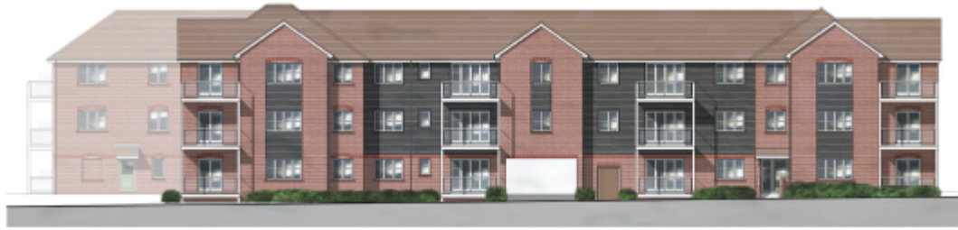
FRONT ELEVATION - A