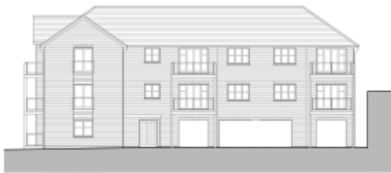
SIDE ELEVATION - B