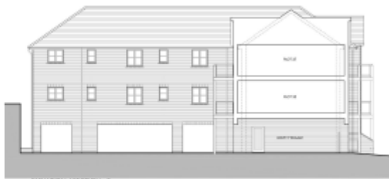
ELEVATION / SECTION - E